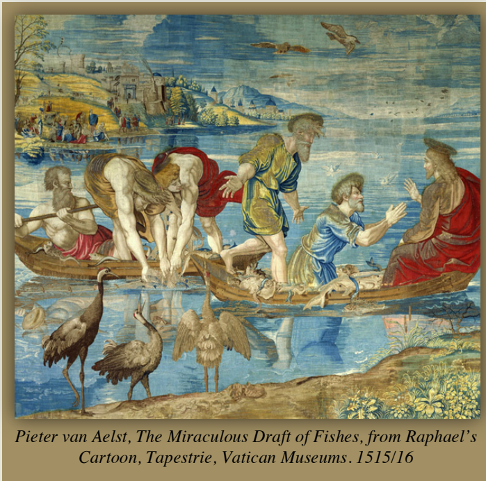
Pieter van Aelst, The Miraculous Draft of Fishes, from Raphael's Cartoon, Tapestry, Vatican Museums. 1515/16

In this Raphael year commemorating 500 years from his death in 1520 with the many events organised in Italy, England and other parts of the world, the Victoria & Albert Museum will reopen the Raphael Cartoons Room which has been under restoration from last year. The Cartoons here on loan from Queen Victoria were offered in honour of Prince Albert, after his death, to the Museum he created and supported after the Crystal Palace Exhibition.